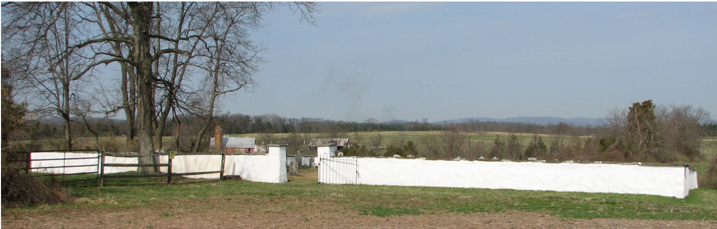
Leidy/Leidichs/Leydig/Leidig Burial Ground (photos 2013)

“This burial ground is located near the southeast corner of Upper Frederick township, Montgomery County, about one mile south-east from Keelor’s Church at Obelisk. It is not on a public road but is located in a field over the crest of a hill about 2/10 of a mile off a paved road called ‘Keyser Road’ on the Montgomery County map. It is reached over a grass-driveway along the edge of a field. . . . “In addition to the burials listed in this article, there is another printed list of epitaphs copied by George S. Nyce and printed in [The] Perkiomen Region, Past and Present , [Vol. 1, No. 2, Henry S. Dotterer, Editor] in [October] 1894, pages 8, 29, and 54. This lists only about 50 gravestones, whereas there are today still approximately 100 stones with readable inscriptions. . . . “The numbers on the list that follows correspond to the numbers used in the earlier lists . . . . Row one begins at the westernmost corner and the listings are going from left to right.” [Leydig-Leidig Burial Ground compiled by Raymond E. Hollenbach, Royersford, PA, September 1969.] Gravestone inscription below translated from this source.