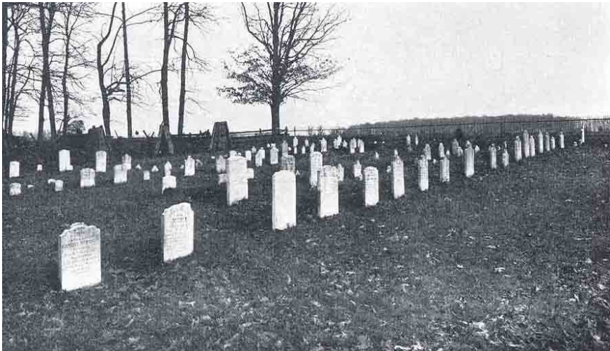
GR plate 119. “Salford Schwenkfelder Cemetery” (photo before 1923)